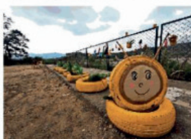
विलावर के विलावर पार्क में कचरे से बनाया गया 'वेस्ट टू वॉटर पार्क' की शुरुआत

विलावर म्यूनिसिपाल कमेट्री ने विकसित करने का प्रयास कर रहे हैं। वहीं सुंदर बन दिख रहे हैं, जहां वेकेशन लेबर मारिटाज सुख-सुविधाएं और बच्चों के लिए खेल के हैं। अलग-अलग हैंडलिंग के लिए 'वेस्ट टू वॉटर' की शुरुआत की जा रही है।