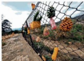
विलावर में आरंभित 'वेस्ट टू वॉटर पार्क' की शुरुआत

जम्मू: 'वेस्ट टू वॉटर पार्क' के तहत म्यूनिसिल कमेट्री ने विलावर किया है। वहीं से विकसित करने का प्रयास कर रहे हैं। वहीं सुंदर बन दिख रहे हैं, जहां वेकेशन लेबर मारिटाज सुख-सुविधाएं और बच्चों के लिए खेल के हैं। अलग-अलग हैंडलिंग के लिए 'वेस्ट टू वॉटर' की शुरुआत की जा रही है।